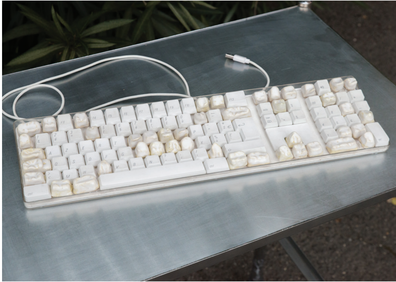
Sentimental training , détail