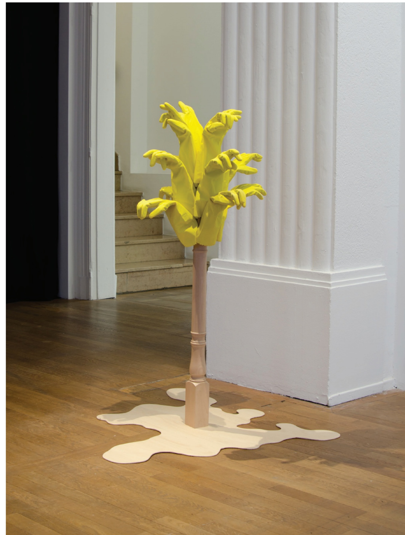
Totem-Voyage 10, Palmo

Artline Kunstmagazin Basel November 2018