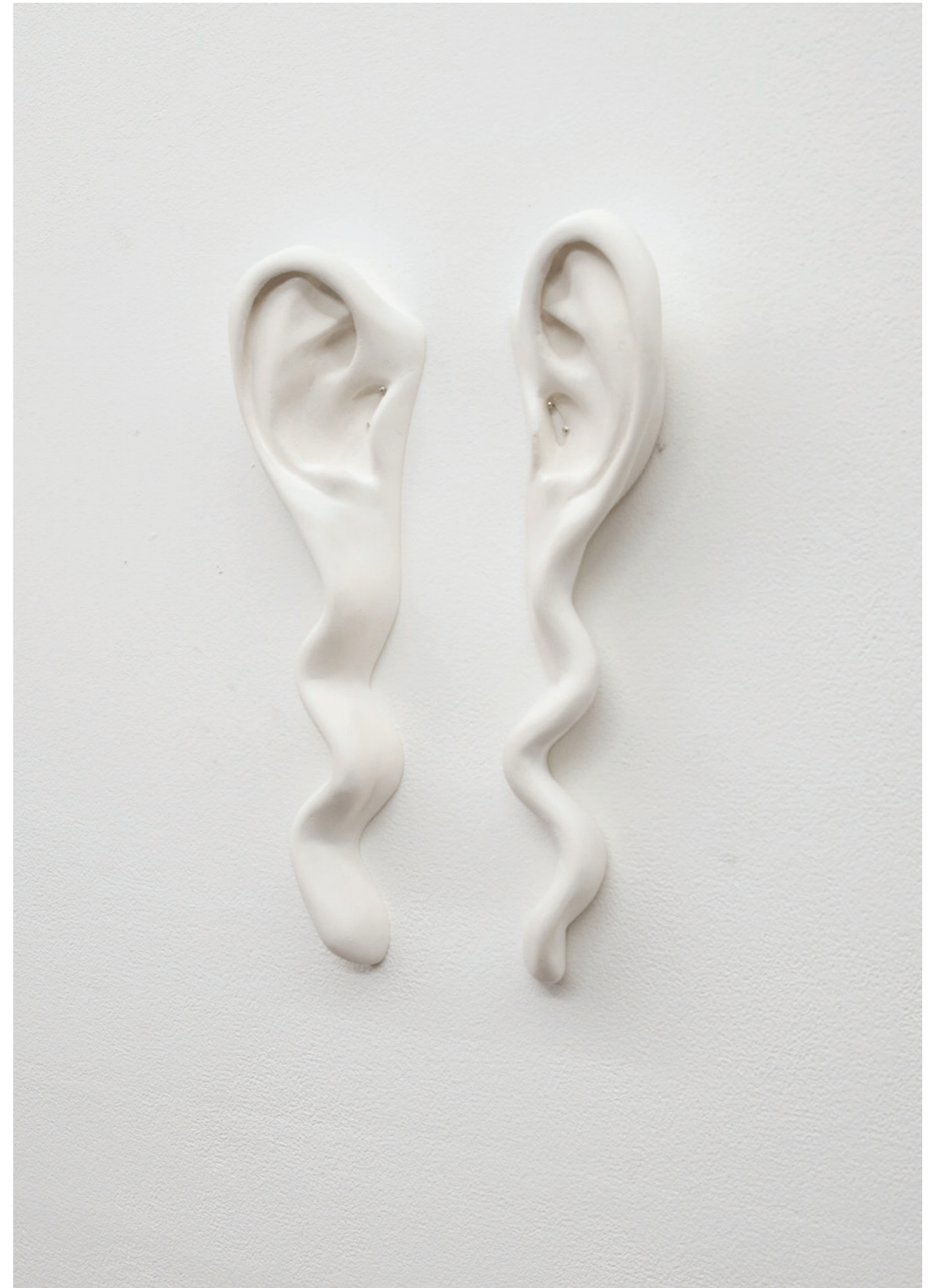
Earing (détail), 21,2 × 12 × 2,7 cm, 2026