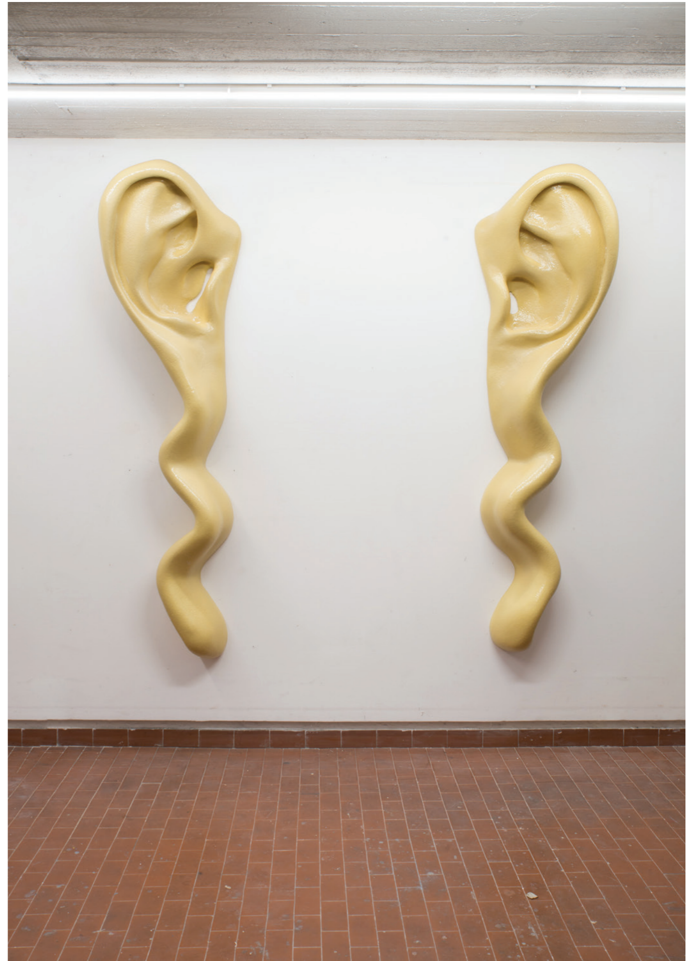
Un Air de Famille , resin, 200 × 200 × 26 cm, 2026