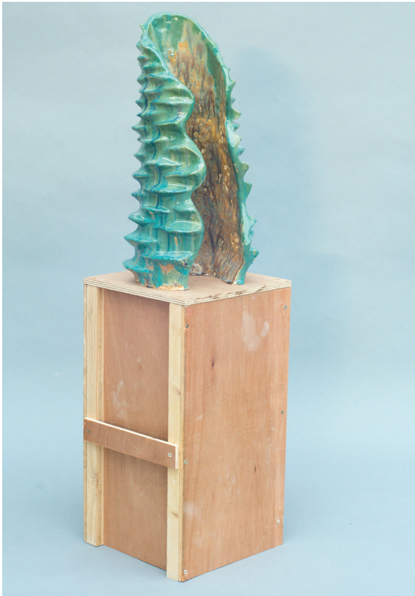
Crème solaire (2) , ceramic, 49,6 × 24 × 23,6 cm, 2023