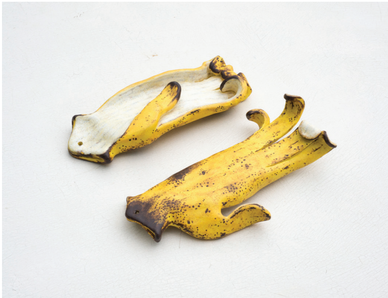
Banana Gloves , (détail)