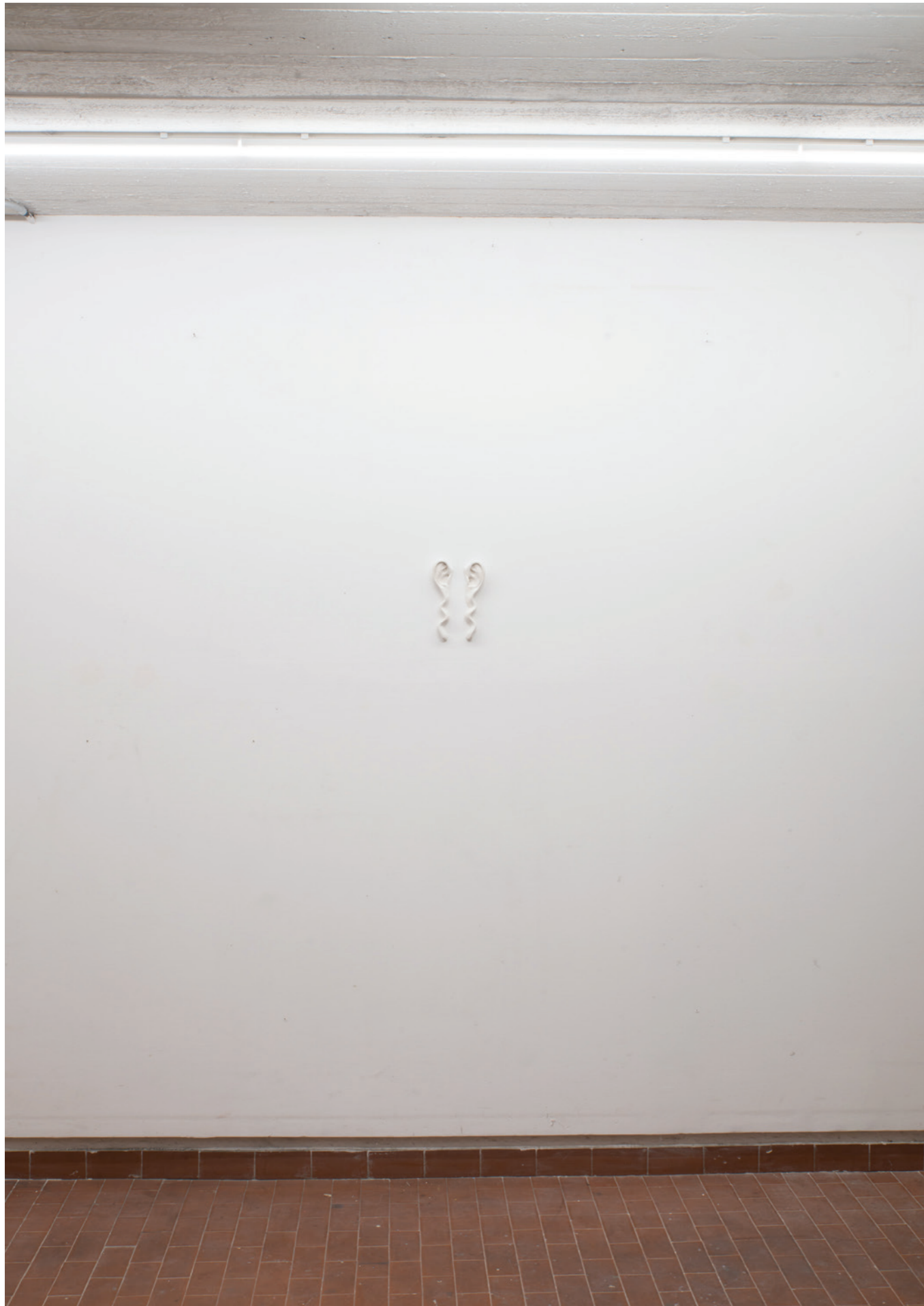
Earing , plaster, 21,2 × 12 × 2,7 cm, 2026