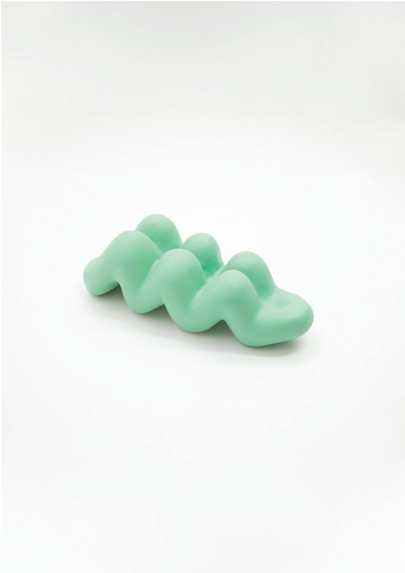
Mascheroni, lingua 1 , acrylic resin, 25 × 30 × 75 cm, 2025