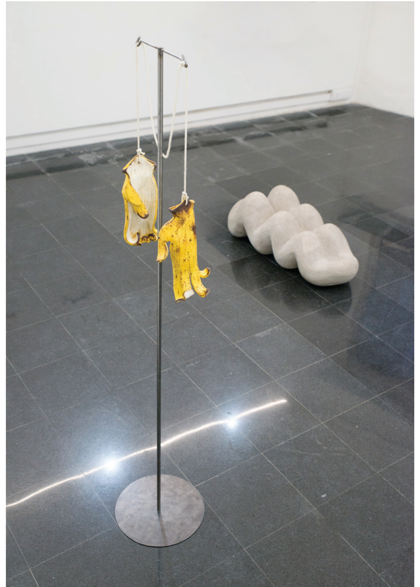
Banana Gloves (front), Sling slang slug (back), exhibition view, Materials and Motions , Galleria Eugenia Delfini, 2025