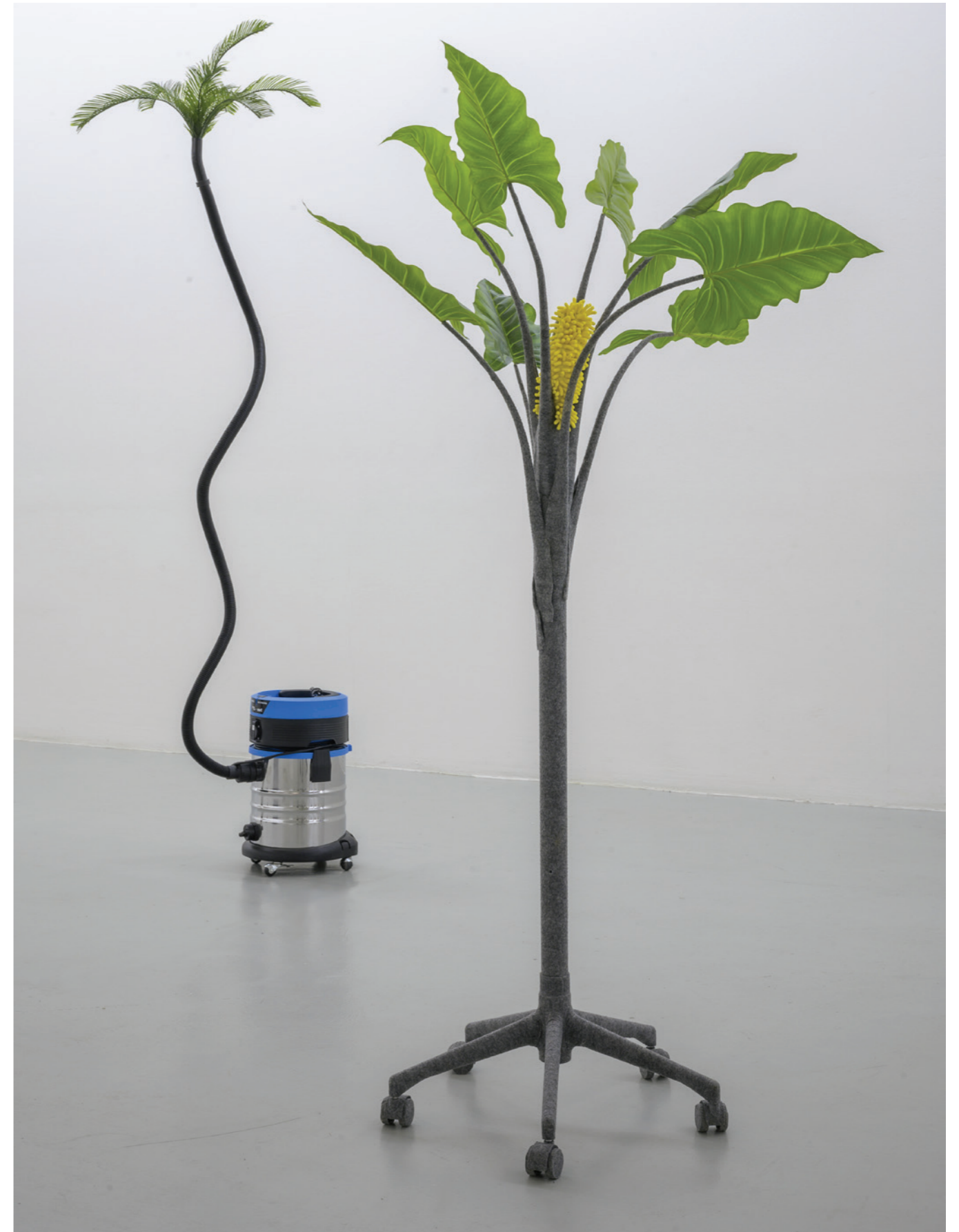
Totem-Voyage 12, Aspiration Vacances (back)

mixed materials 267 × 63,5 × 120 cm 2020