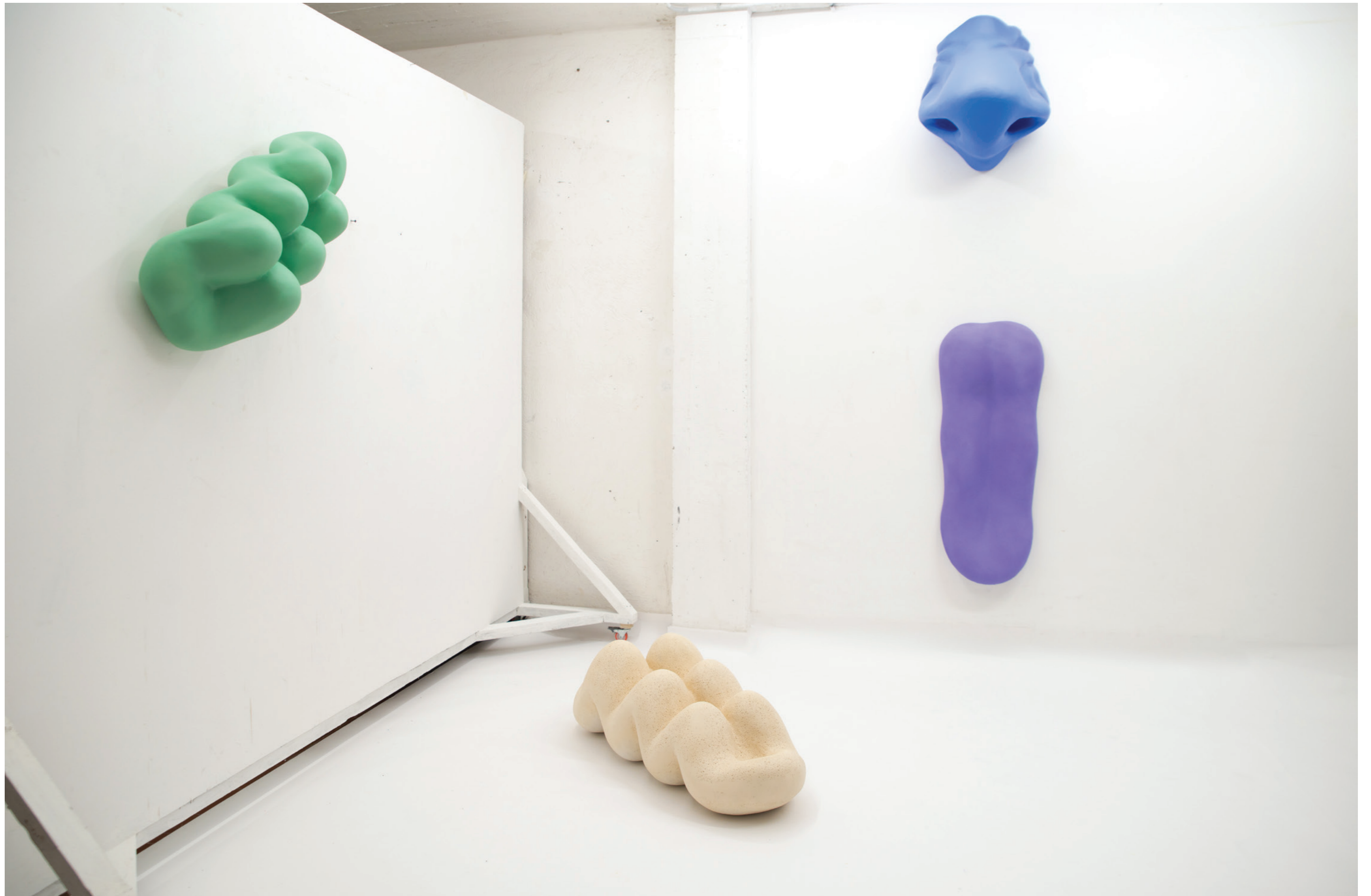
Mascheroni , acrylic resin, variable dimensions, 2026