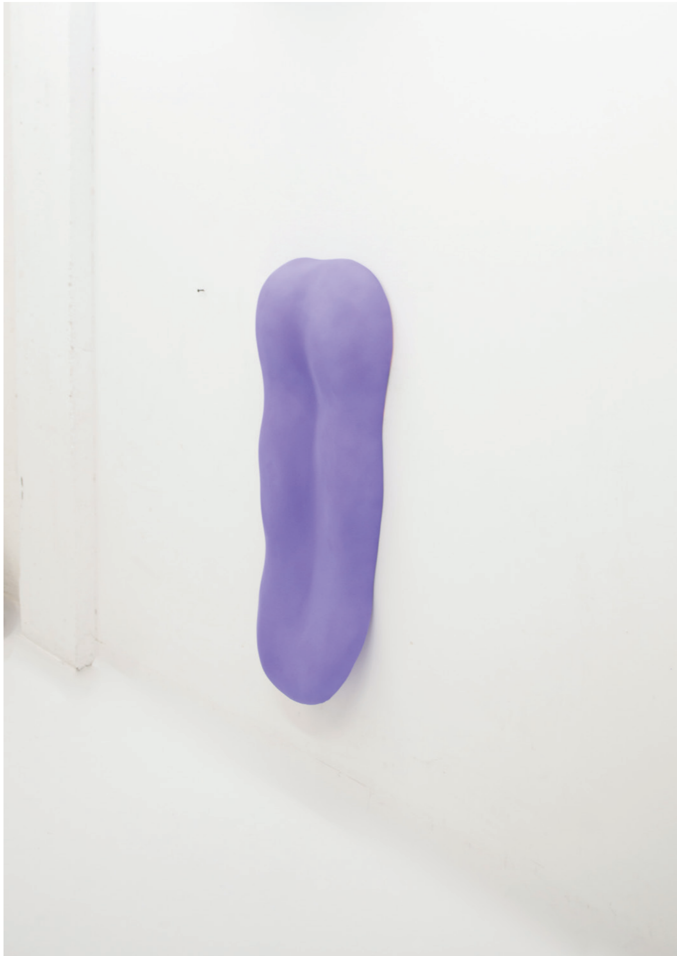
Mascheroni, lingua 3 , acrylic resin, 95 × 38 × 8 cm, 2025