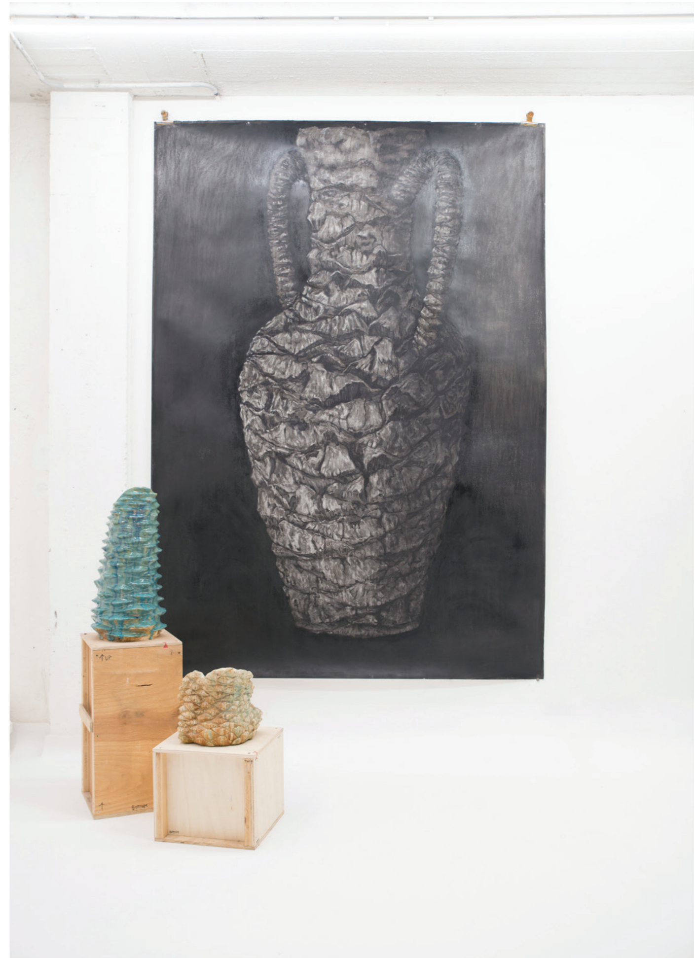
Crèmesolaire (1) & (2) , ceramics, 2023 - Le Manteau charcoal on paper, 244 × 150 cm, 2023