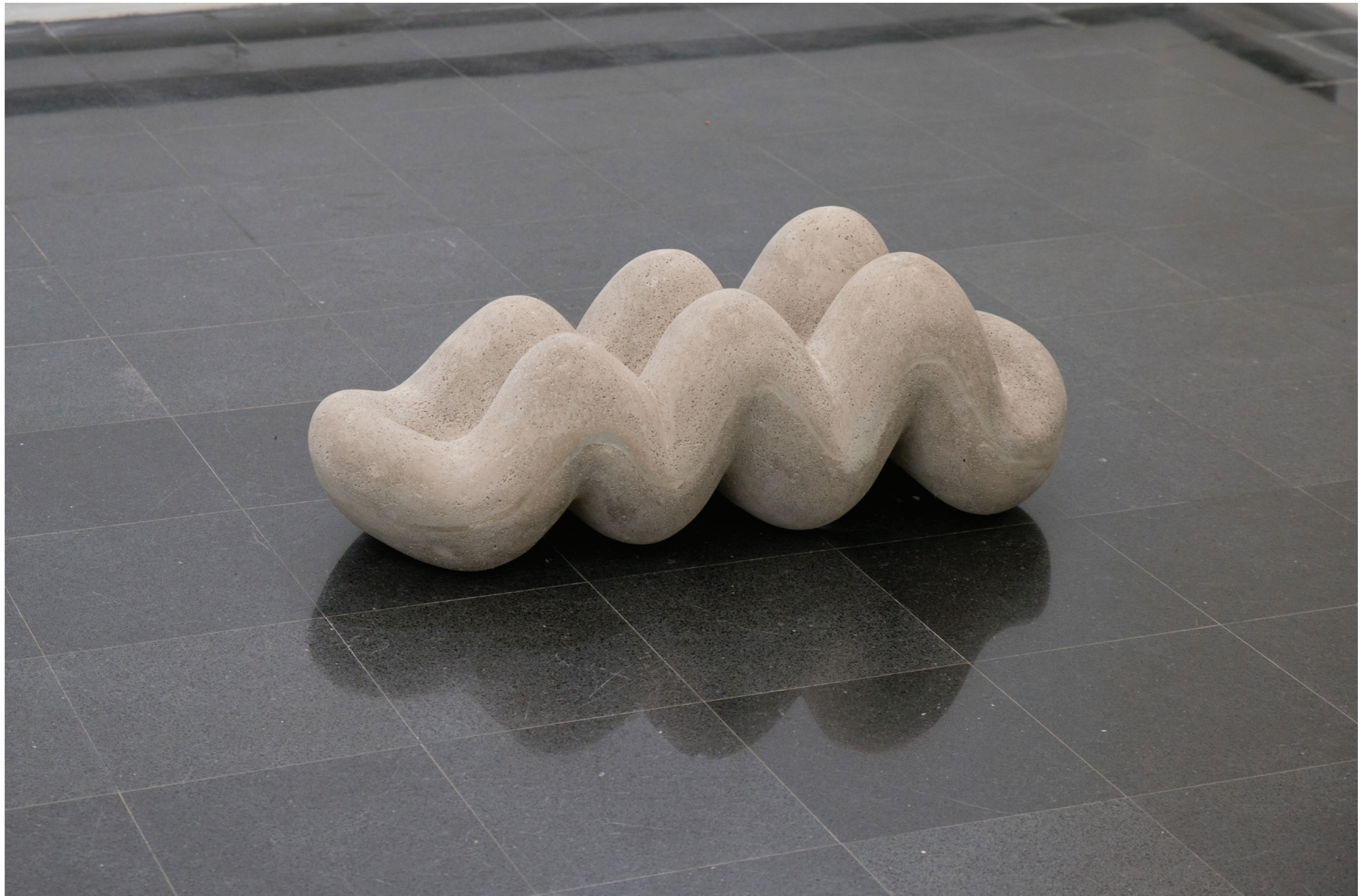
Slinglang slug , concrete, 31,5 × 90,7 × 40 cm, 2025