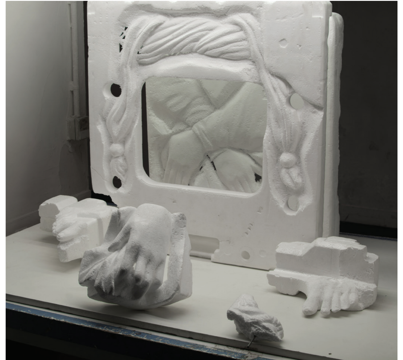
Copyshop, Atlas Mnemosyne