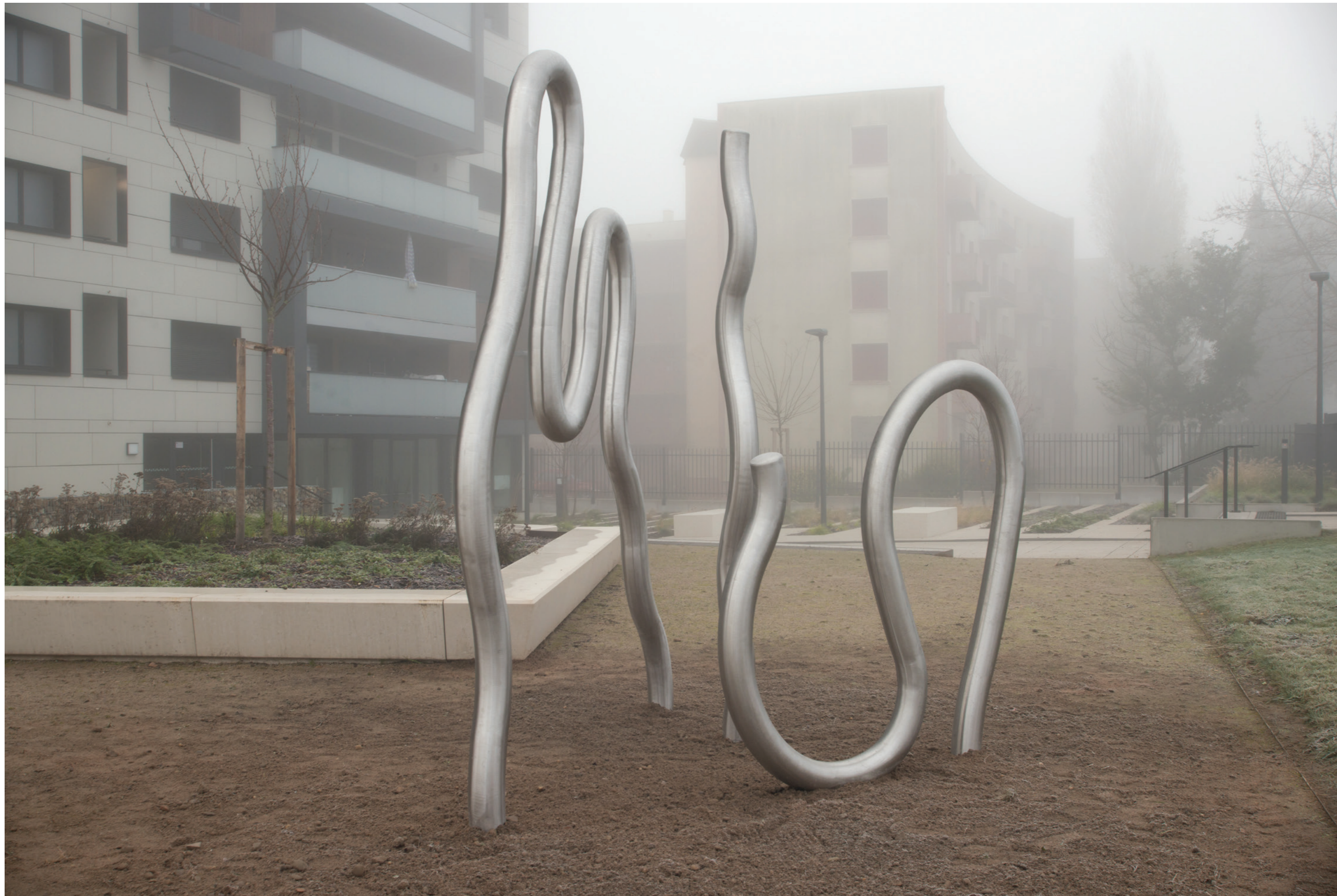
MIS, Extrait d'un Paysage-Écriture , stainless steel, 350 × 246 × 177 cm, 2023