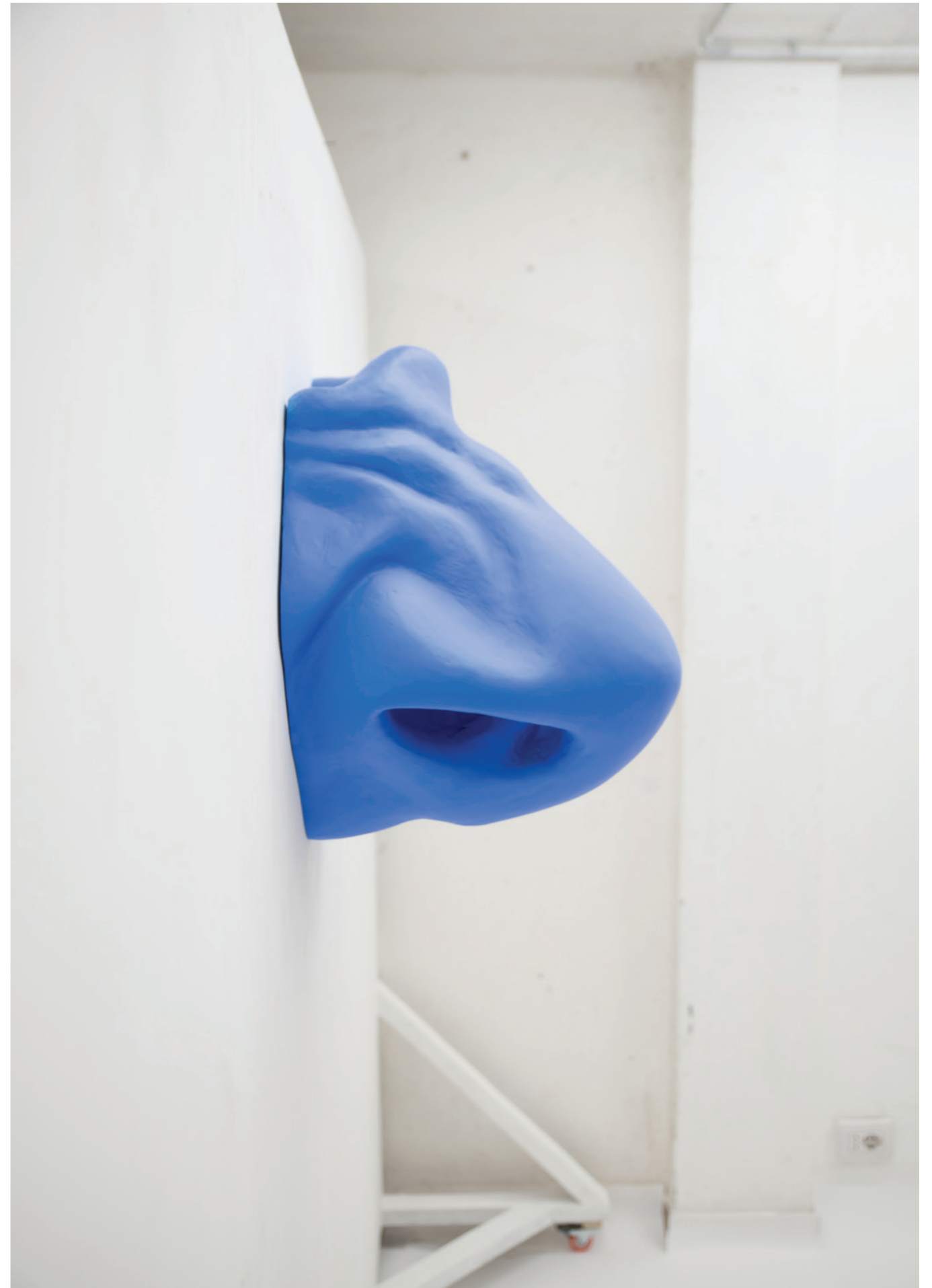
Mascheroni, naso blu , acrylic resin, 60 × 50 × 50 cm, 2026