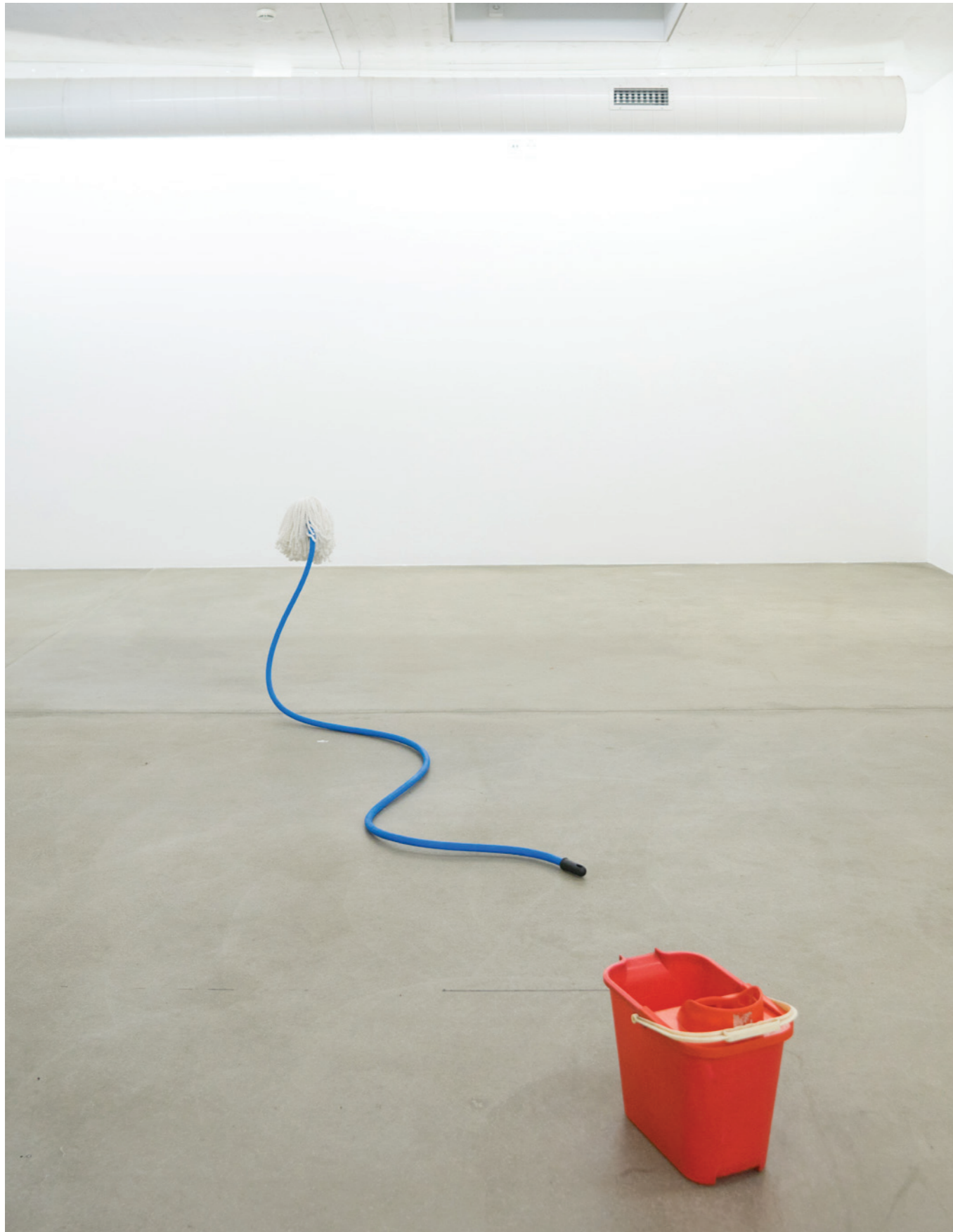
The Snake a.k.a. the_geat_escape