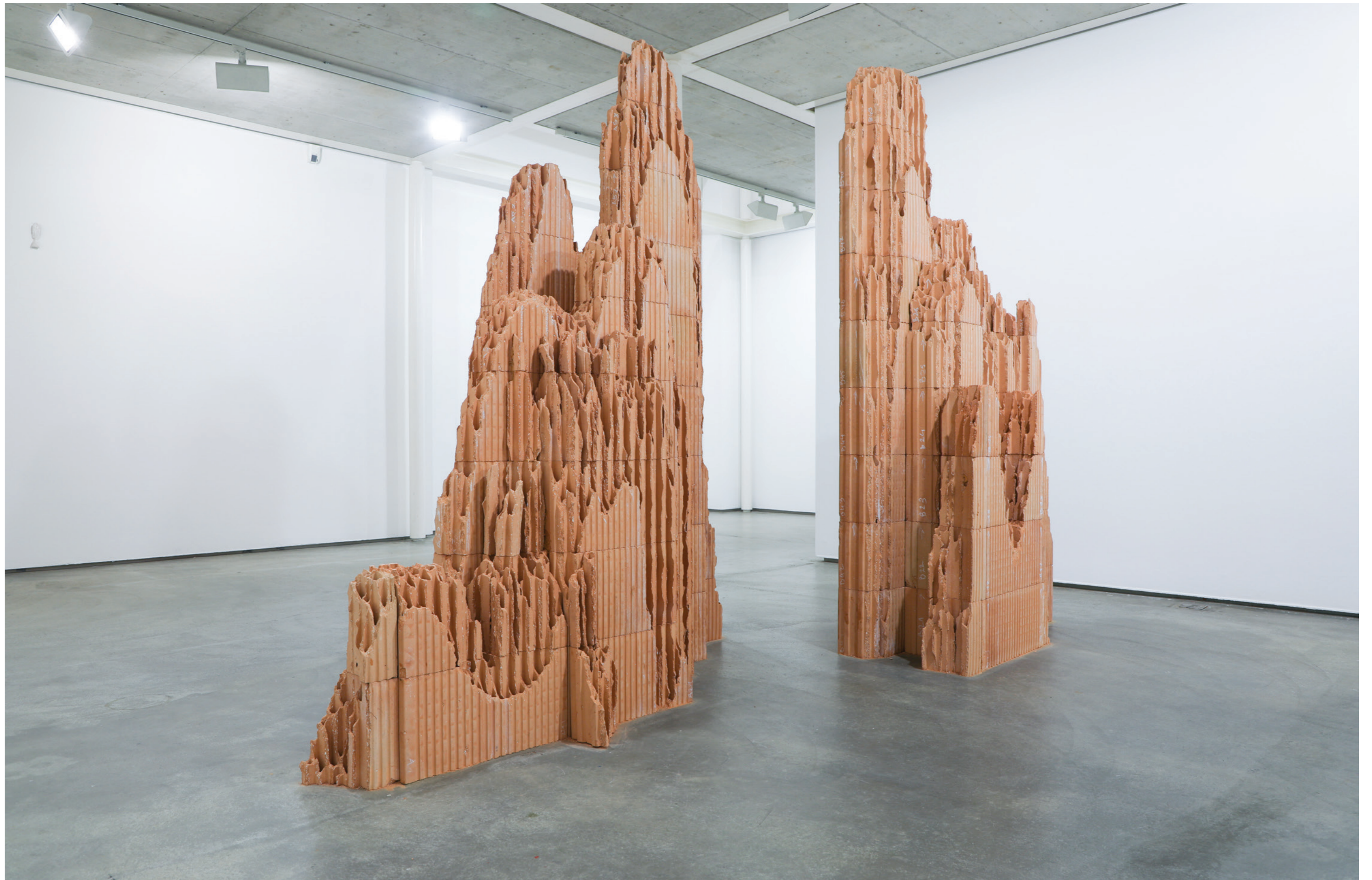
Falaise (4) - Cathédrale , bricks, 225 × 301 × 138 cm, 2022