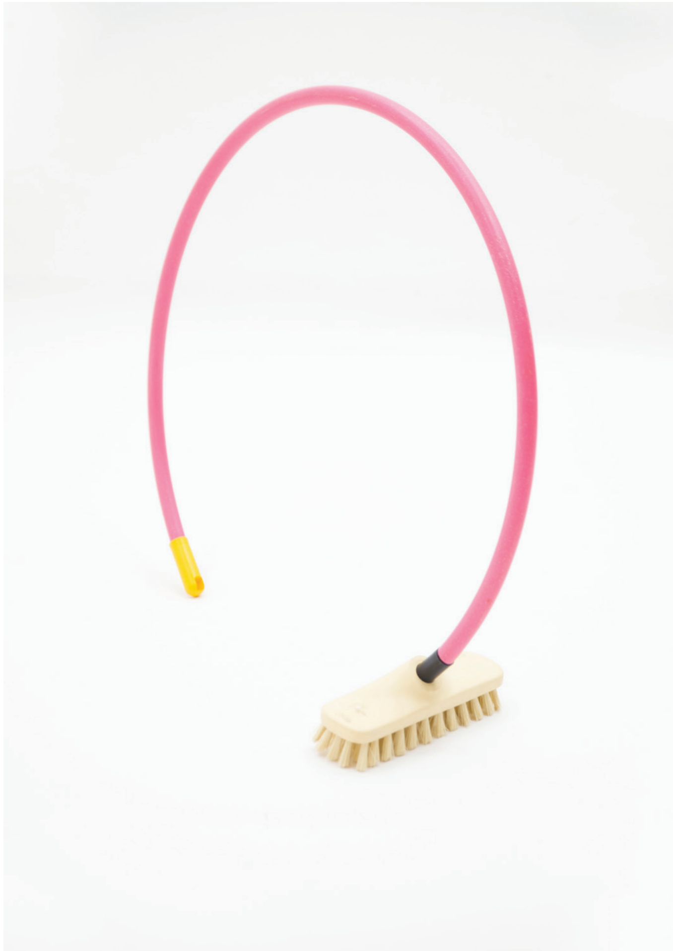
Breakdance , brush, hula hoop, copper tube, 85 × 85 × 30 cm, 2021