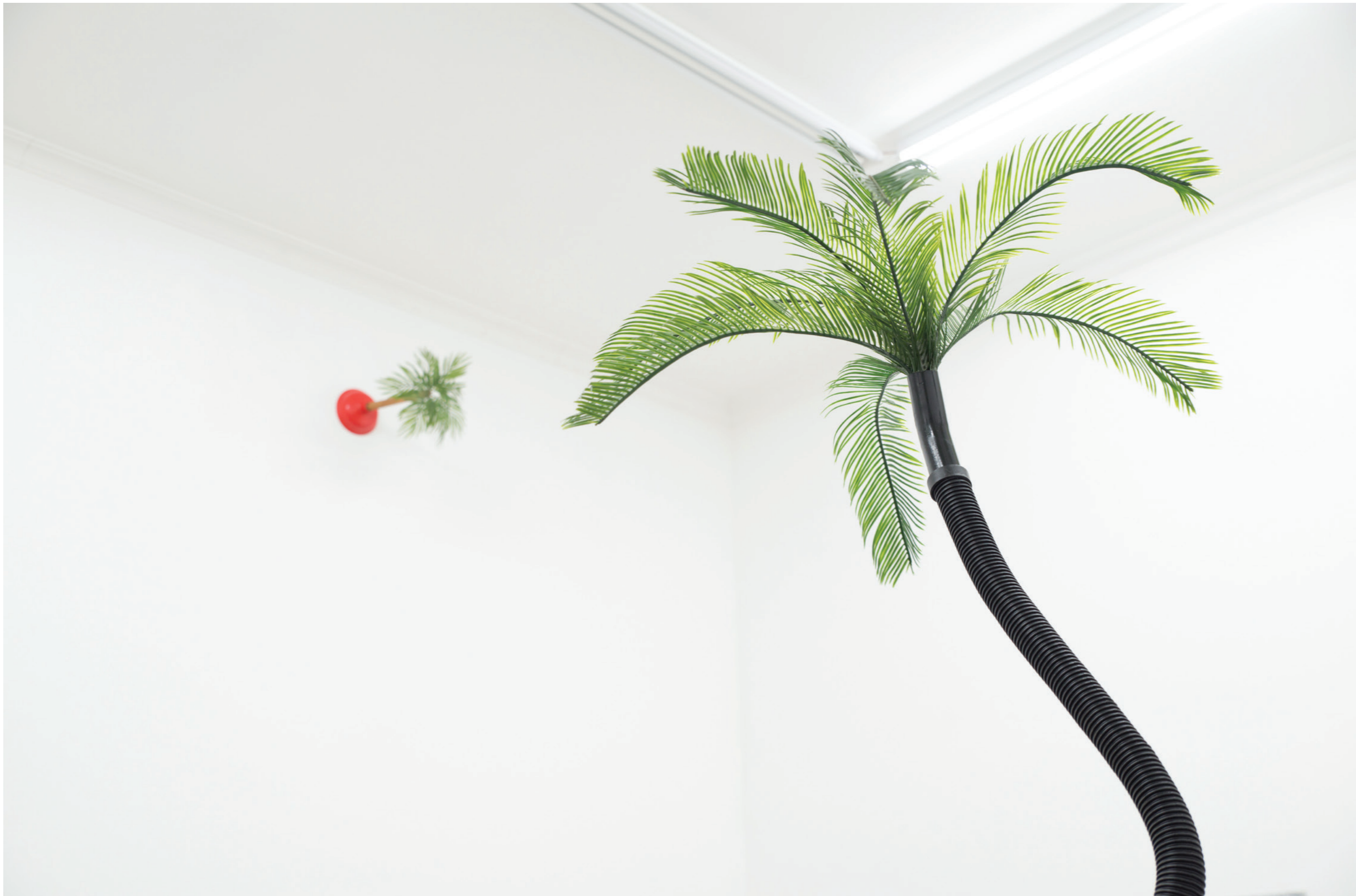
Backroom , ( details ), curated by Spazio IN SITU, on view : Totem-Voyage 09 L'Île & Totem-Voyage 12 Aspiration Vacances , Spazio IN SITU, Rome - IT, 2026