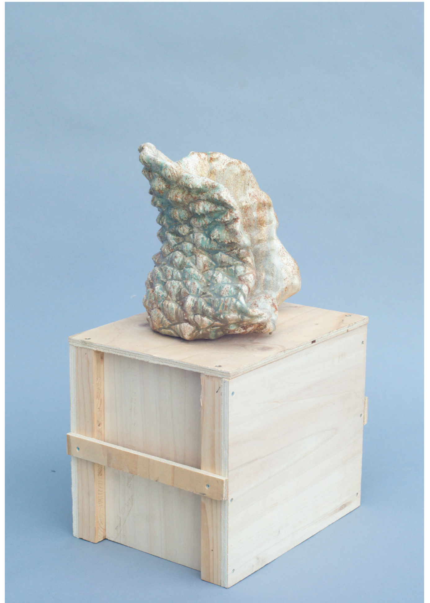
Crème solaire (1) , ceramic, 23,5 × 27 × 21,3 cm, 2023